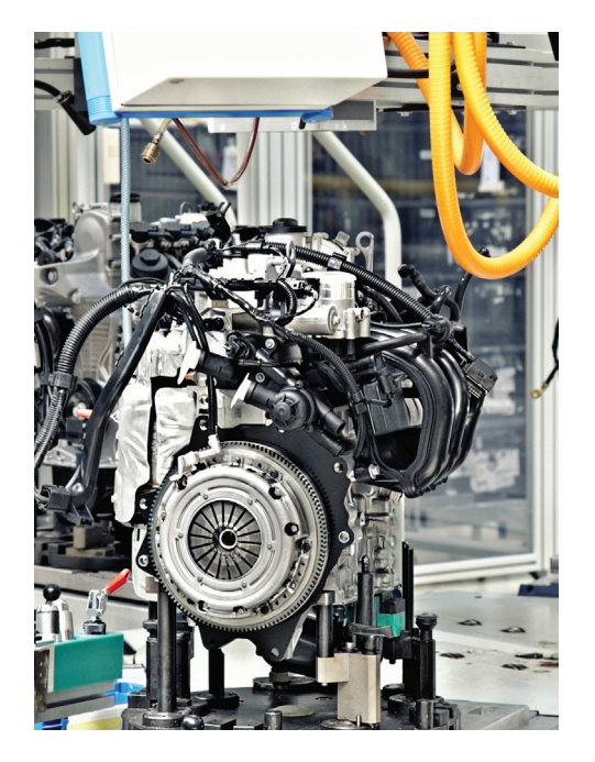
In automotive applications, actuators are used in presses that insert bearings, bushings, gears, and more into vehicle assemblies. Electromechanical actuators are often chosen for these applications due to their efficiency and accuracy.

Press systems need to strike the unique balance between performance and cost, whether it is pressing bearings on axle shafts or welding vehicle frames. Actuator selection for these machines is critical to the performance of the system, and to the total cost of ownership of the manufacturing facility.