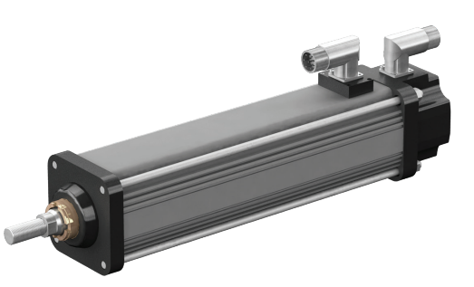
Electromechanical actuators with integrated motors can fit the footprints of the hydraulic cylinders they are replacing. Other designs permit bolt-on motors or integrate drivers as well.

Electromechanical actuators can be easily programmed for different pressing modes. For instance, a press-to-position mode tells the controller to continue the pressing motion until a precise position has been reached. Press-to-force lets the controller continue the motion until a certain force is returned as feedback, for instance when a ball bearing bottoms out on its race during a press operation. In addition, electromechanical actuators can be quickly programmed with new motion profiles as manufacturing requirements change or if rapid part changeover is required.