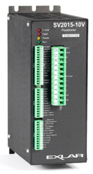
SV Series Digital Positioner

Exlar's SV Series Positioner is designed specifically for use with Exlar rotary and linear actuators to control valve and damper applications.