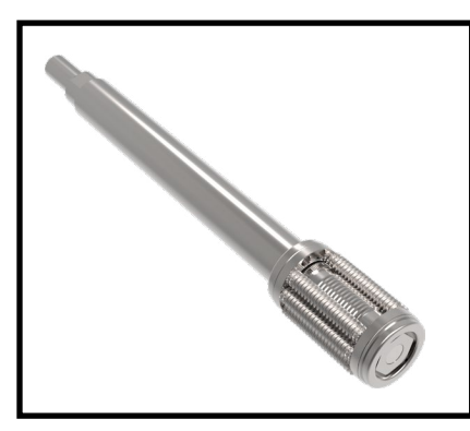
Inverted Roller Screw